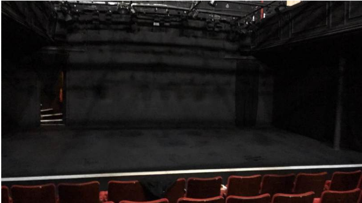
The Bedlam Theatre stage, as seen from the centre of the auditorium.

Storage space is shared between all shows, and we have very limited capacity, with approximately 2m 2 allocated per production. If your show requires additional storage, please get in touch with us as early as possible.